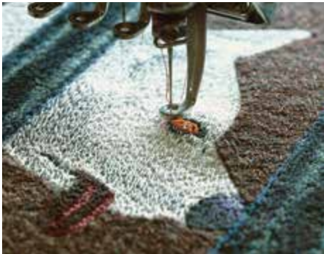
Vezenina lahko vsebuje milijone vbodov. Embroidery can consist of millions of stitches.