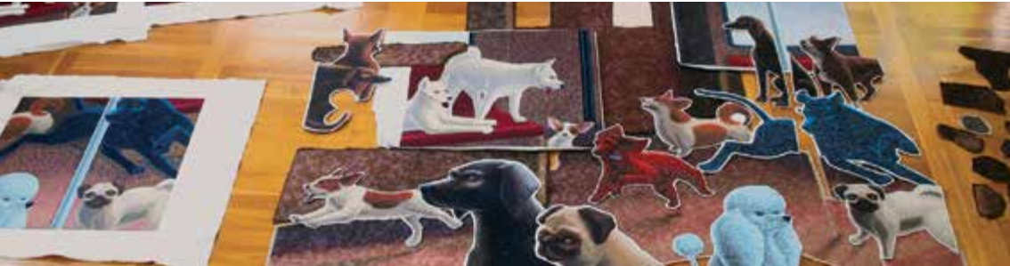
Študije posameznih detajlov slike / Studies of various details of the motif