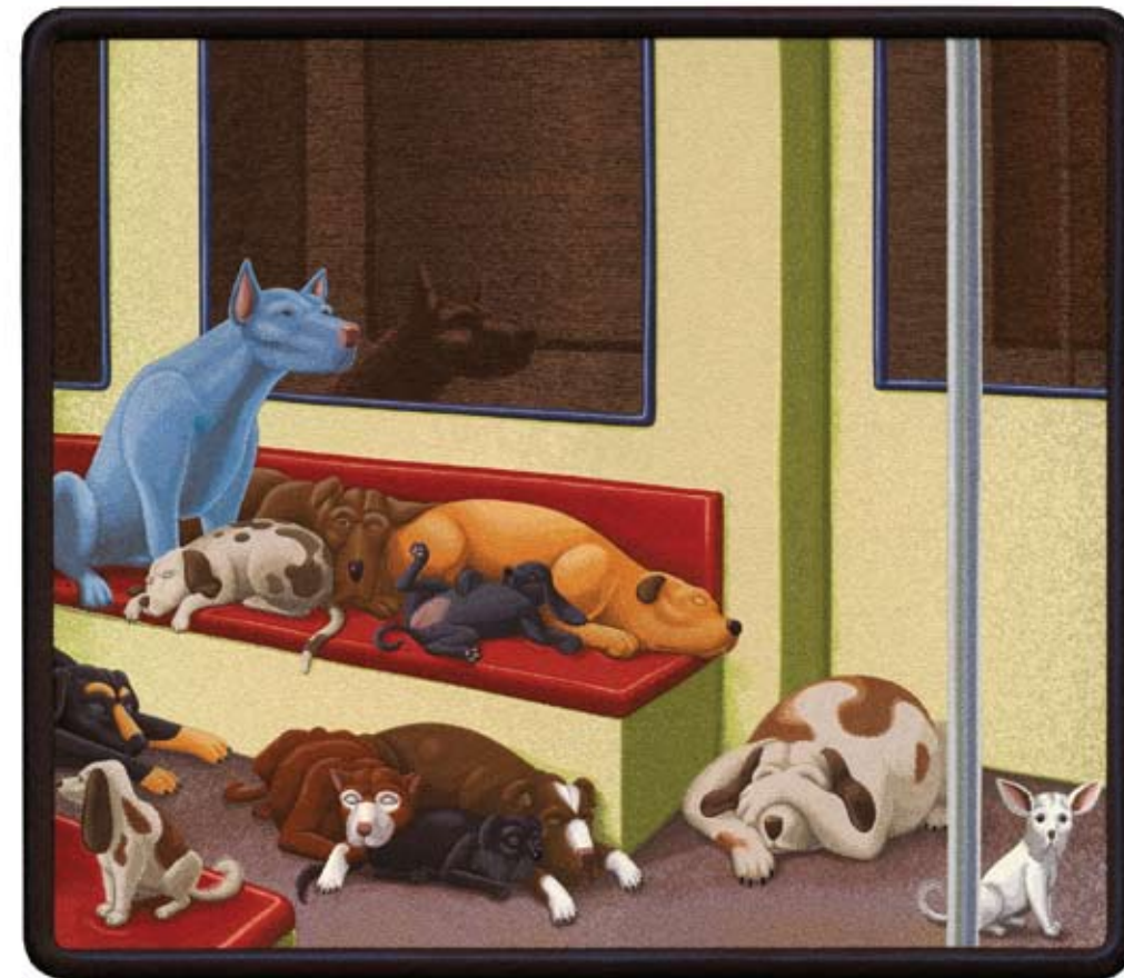
Vladimir Leben & Ercigoj Art Pasje življenje / A Dog's Life Vezena slika / Embroidered art Triptih / Triptych, 3x130x150 cm